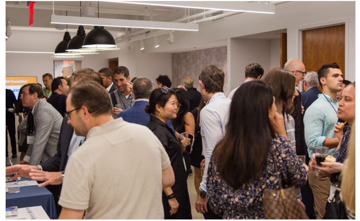
Members socializing prior to the evening's lecture.