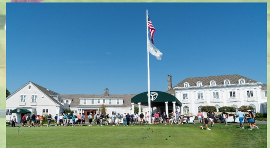
It was a beautiful setting and day for the 5th Annual NYCDS Charity Golf Outing.