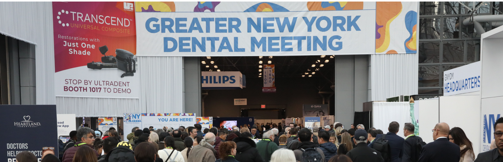
The 2024 Greater New York Dental Meeting, held at the Javits Center.