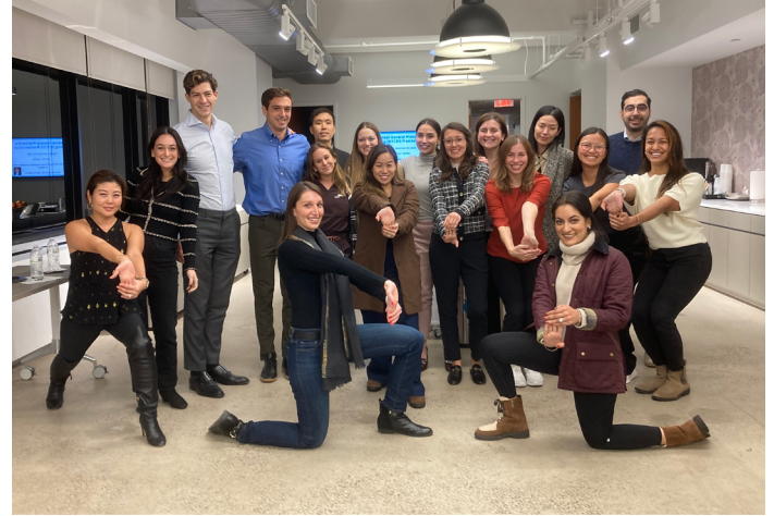
New Dentists demonstrating one of several stretches they learned at the November 1 st wellness program on dental ergonomics.

The committee is looking forward to its first program of 2024 on January 18, Money Matters for New Dentists: Personal Finance and Accounting for Employees, Independent Contractors, and Owners.