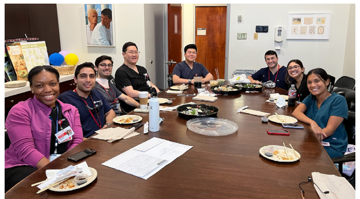
New York-Presbyterian Hospital/Weill Cornell University Medical Center residents took time to hear first-hand about the importance of ADA involvement.