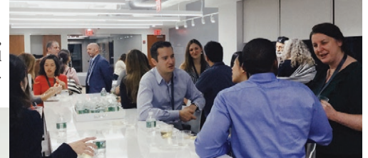
Mingling at the Wine, Cheese, and “Cheese” event.

We could have called it Wine, Cheese, and “Chill” because that is exactly what everyone loved about the event for Young Professionals on November 7—the chance to chill with new and long-time colleagues in a relaxed setting. There was also the opportunity to get a professional headshot taken which was an added bonus. Stay-tuned for more events geared for new dentists in 2019!