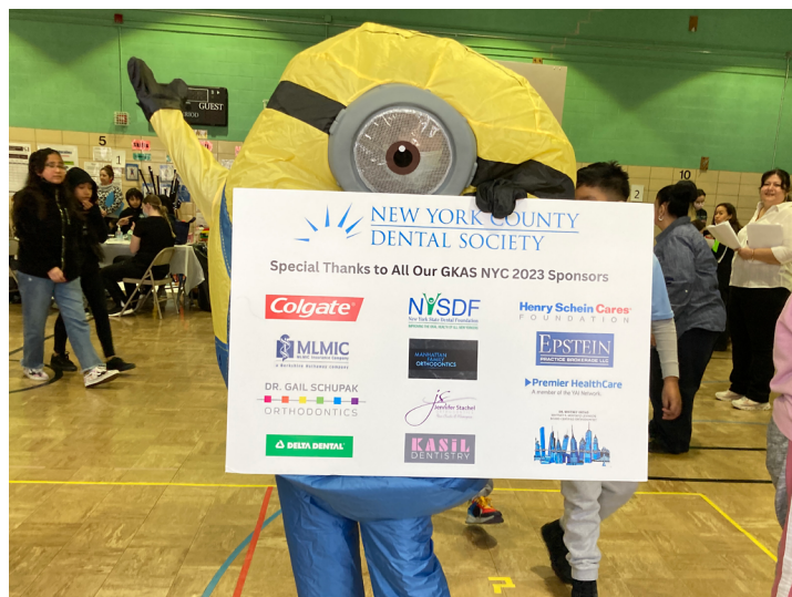
Thank you to all the generous GKAS NYC 2023 sponsors!