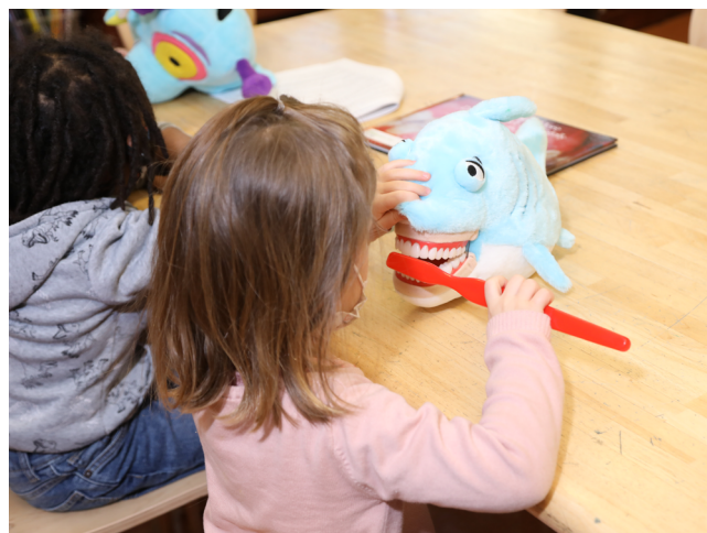
A student practices the proper brushing technique that she learned at GKAS.

Save the date – Give Kids A Smile 2024 is on Friday, 2/2/24!