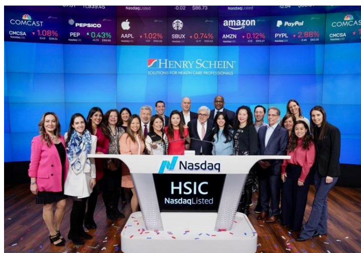
GKAS NYC and Henry Schein leadership opening Nasdaq on February 6.