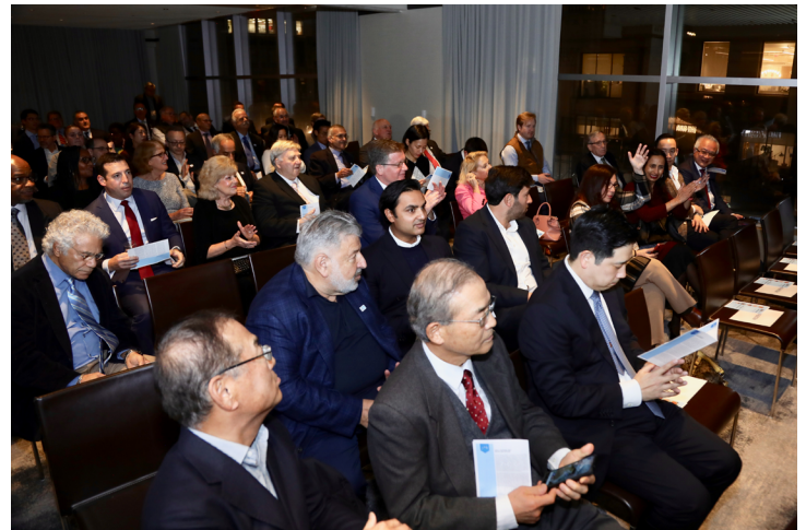
Members and guests during the Installation proceedings.

Many thanks to our Installation sponsors Epstein Practice Brokerage, Henry Schein Dental, Mission Disrupt, and PFK O'Connor Davies for their support.