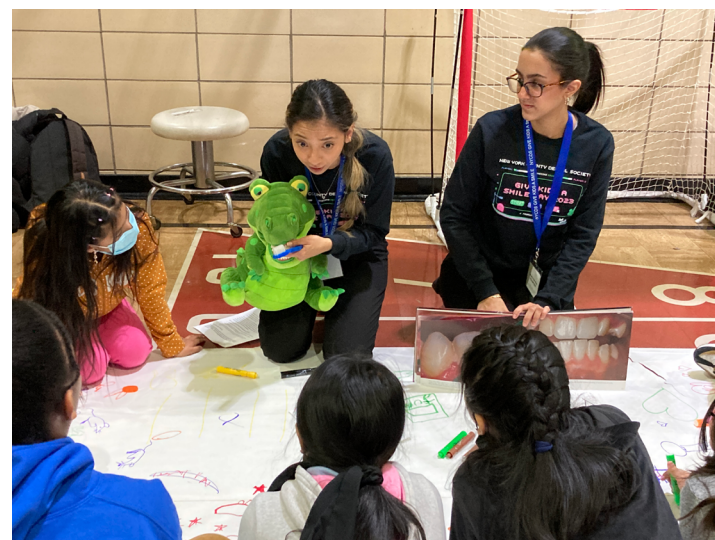
Volunteers teaching students about oral health and hygiene using books and puppets.