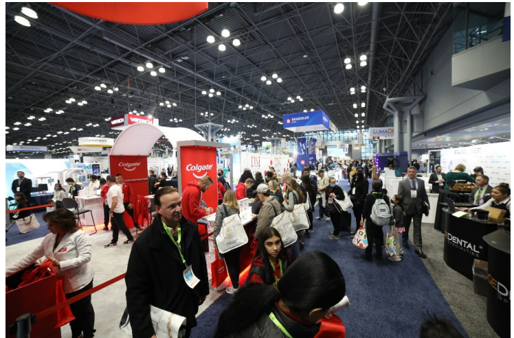
Scene from a busy exhibit hall at the 2022 GNYDM.