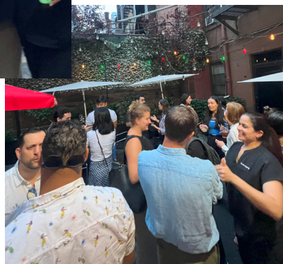
Members mingling in the outdoor space of Garlic Bar & Restaurant over pizza and drinks.